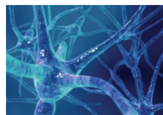
These steroidal nitrone derivatives represent a therapeutic alternative for the treatment of Ictus and neurodegenerative diseases as Alzheimer, Parkinson and Amyotrophic Lateral Sclerosis (ALS).

Some steroidal nitrone derivatives have been prepared. In vitro assays in cell cultures show that these compounds present synergistically the properties of steroid and nitrone groups: improved cell permeability to cross the blood-brain barrier, elevated antioxidant activity against hydroxyl radicals and lipidic peroxidation, and high neuroprotective capacity. These properties make them especially useful as drugs for the treatment of CNS related diseases, as Ictus and neurodegenerative diseases, as Alzheimer, Parkinson and Amyotrophic Lateral Sclerosis (ALS).